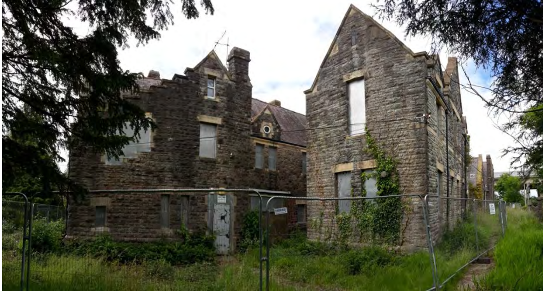
Figure 11 - 1896 'baronial' entrance range