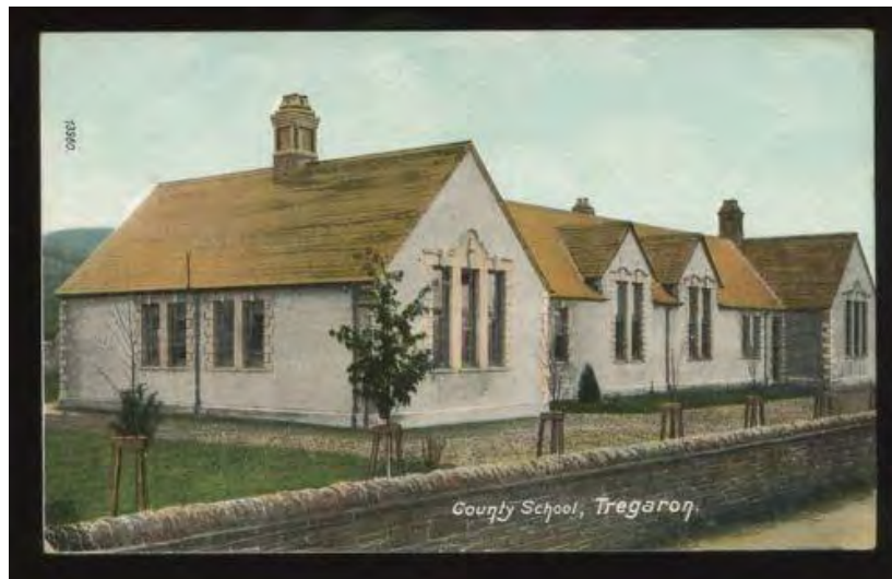
Figure 4 - Tregaron Intermediate School (1898 by L. Bankes Pryce) - typical single-storey design

The majority of the new schools were day schools, with only a few (including Cowbridge) providing for boarders. Most were designed by local architects, two in particular - J.H. Phillips of Cardiff (commended in the Tate Competition) and Harry Teather of Cardiff - specialising in designing new county schools across Wales. Good open sites were vital - almost all of the schools were built on open sites for aesthetic/health considerations and the ability to expand later (which most did). Many of the schools were single-storey, those on constricted urban sites or within more populous areas rising to two storeys. Typically the schools were symmetrical, comprising a central hall (often with a cupola or lantern) flanked by gabled ranges providing classrooms. The largest schools were in Glamorgan and Monmouthshire, usually two-storey (and in the case of Tredegarville, Cardiff, three).