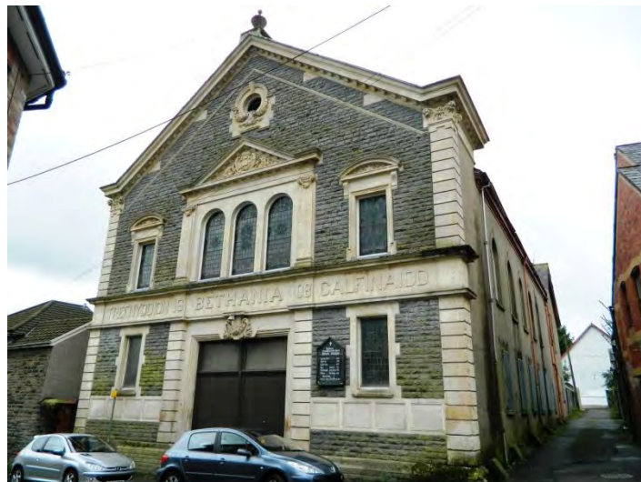
Figure 22 - Bethania, Tonypany (1908 by R.S. Griffiths)

5.4 The architects - R.S. Griffiths. Rhys Samuel Griffiths, designer of the 1909 additions to the school is an easier figure to track down. Better known as R.S. Griffiths, he was born in Llannon, Carmarthenshire in 1859, son of Samuel Griffiths, master mason. By 1891, he was living at Llwynypia, described in the census as 'architect and land surveyor'. He was a local figure of some importance, serving as J.P. as well as a councillor for Rhondda District Council. Griffiths was a prolific and competent local architect, relied on for designing chapels, the municipal buildings at Pentre and the police station at Tonypany. He was a staunch Classicist (as his chapels show). As well as Cowbridge, Griffiths designed the intermediate schools at Whitland (1896) and extended the boys' intermediate school at Gelligaer, in 1903.