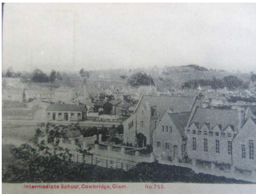
Figure 1- Cowbridge Intermediate Schools, 1907 (shortly prior to extension)