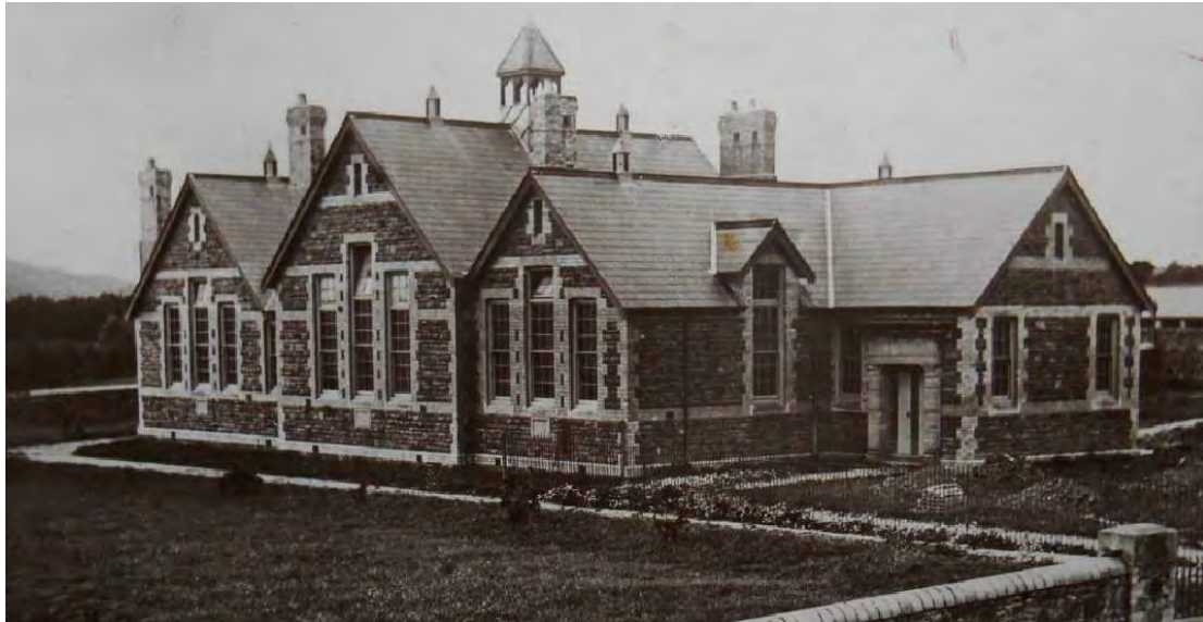
Figure 23 - Whitland Intermediate Schools (1896)

Whitland was a typical smaller intermediate school, Griffiths clearly following the Tate Competition guidelines. The door-cases are the only concession he made to his favoured classicism. The Gelligaer buildings, now demolished, were plain and neatly done. At Cowbridge, Griffiths showed real sensitivity to Williams' work, continuing the use of dressed masonry with ashlar dressings, copying the existing chimney stacks in their striking corner positions, and neatly shoe-horning in the storeyed classroom block to picturesque effect. The classroom block picked up on the dormer detailing of Williams' hall, the central shaped gable almost a leitmotif of Welsh intermediate schools. With Gelligaer demolished and Whitland heavily altered and extended, the extensions to Cowbridge remain as the best-preserved school work of a talented local architect.