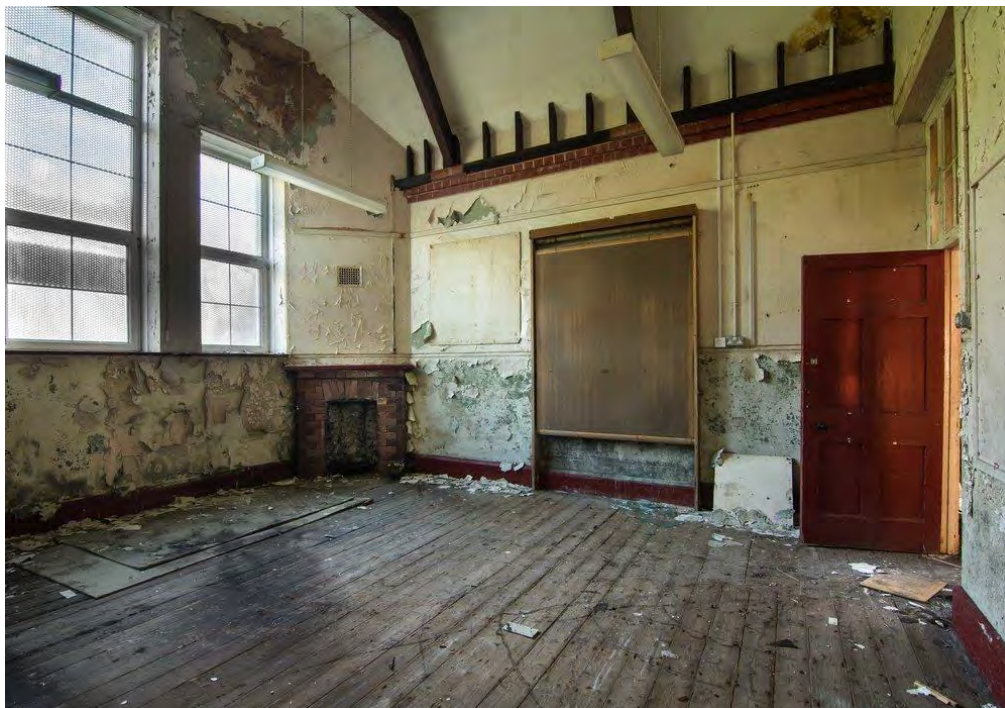
Figure 16 - classroom (showing survival of historic ceilings, doors and fireplaces)