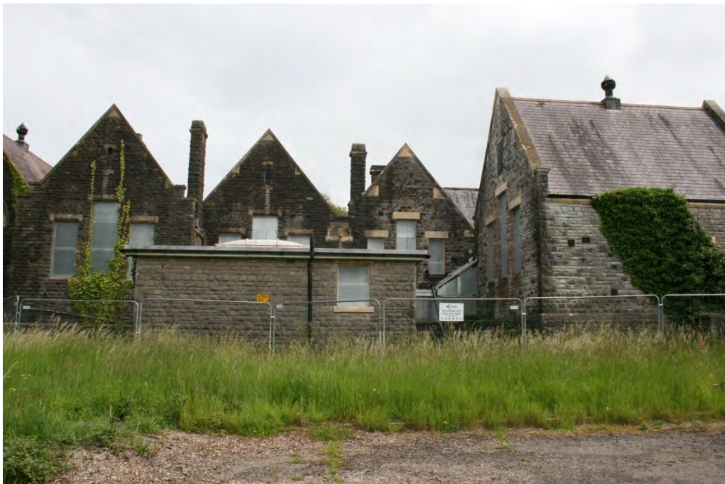
Figure 17 - rear elevation showing survival of chimneys and ridge-vents

5.2 In terms of architectural style, the school architects were evidently permitted free rein as far as the budget allowed. Curved or coped 'Dutch' gables characterise many schools, an echo of the revival of Flemish and North-German Renaissance architecture in the 1870s and 1880s, the 'Pont Street Dutch' of the Kensington and Knightsbridge area that became so influential across urban Britain. Both Ruabon and Aberystwyth have Gothic touches and at Cardigan, the versatile George Morgan worked in an attractive Queen Anne style. Harold Road Schools at Abergavenny has Tudor touches, whilst Tywyn is in a cheerful free style. The larger schools allowed for even more architectural individuality, as at Cardiff, Brecon and Bangor. In this context, the Cowbridge School also has architectural individuality, including the unusual serried dormer gables to the hall block, and most especially in the tall hostel block with its gabled porch and unusual crow-stepped stairwell. The 1909 additions perpetuate the fashionable curved gables in the storeyed classroom block, the large Diocletian window to the new (north) hall emphatically Edwardian 'free style'. The series of chimney stacks are striking (which miraculously survived the usual local authority lopping, as did the cast iron ridge-vents), both phases of building characterised by the use of rock-faced limestone and sparing use of ashlar (instead of the yellow or red brick trim so typical of South Wales).