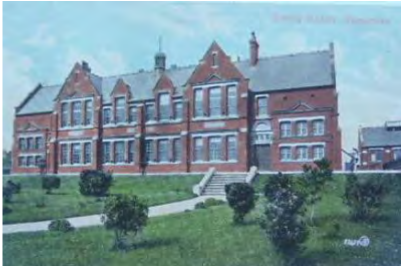
Figure 3 - Caernarfon County Schools, completed 1894