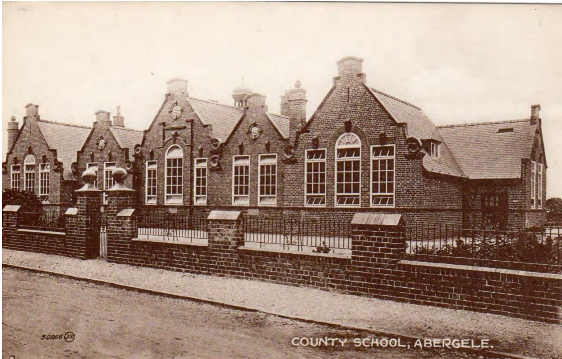
Figure 8 - Abergele Schools (Ysgol Emrys ap Iwan) built 1899