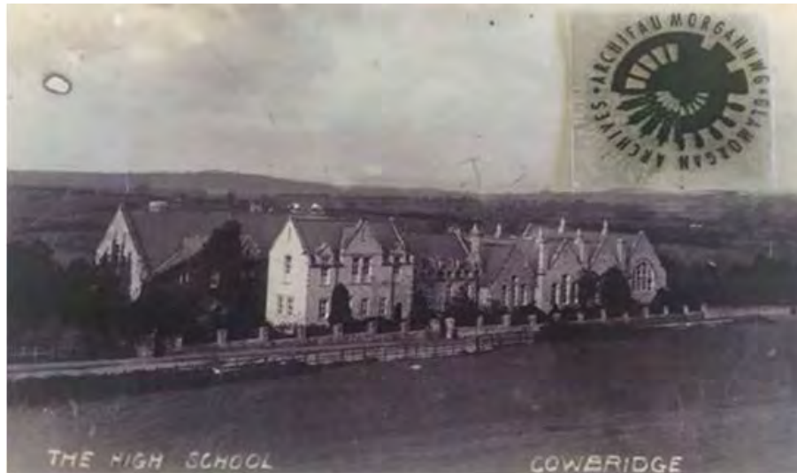
Figure 2 - Cowbridge Intermediate Schools, 1930