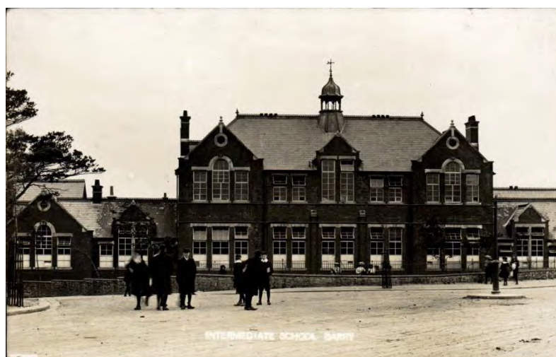
Figure 5 - Barry Intermediate Schools - 1896