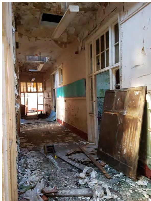
Figure 14 - well-preserved interior layout and screen-doorways