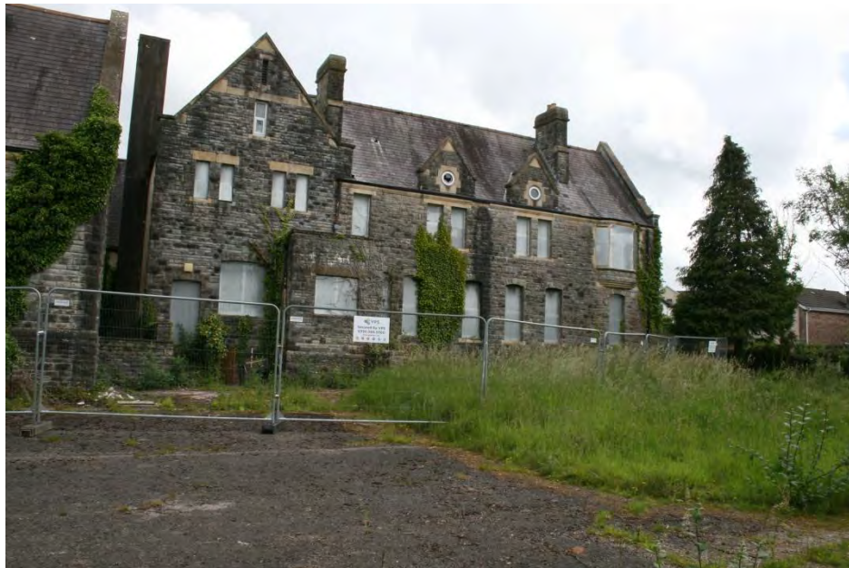
Figure 12 - rear elevation of hostel block showing unusual dormers and attractive oriel