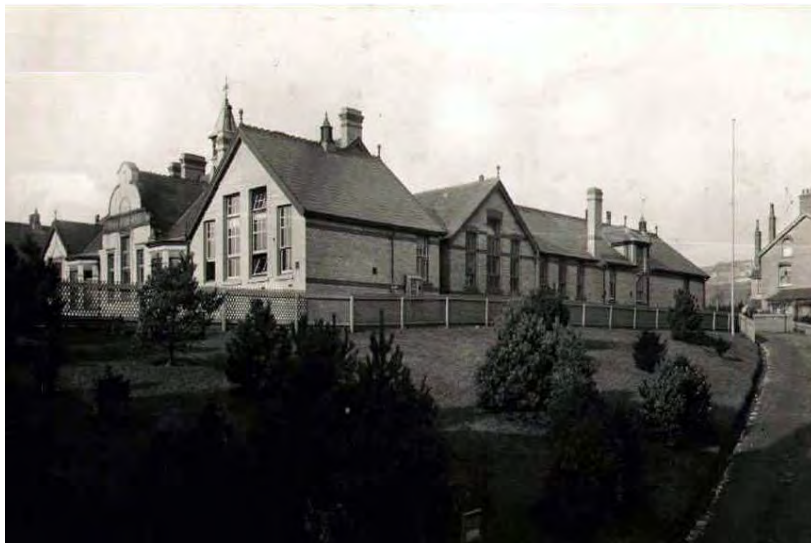
Figure 9 - Ebbw Vale Schools, 1899 by Phillips and Baldwin (dem)

The central hall - usually topped by a cupola or lantern (somewhat reminiscent of the influential Queen Anne style of the London Board Schools of the 1870s) is typically either treated as a central block countering the gabled classrooms in a Puginian manner, as at Cowbridge or Bala or is given more prominent gables instead, as in the cases illustrated above.