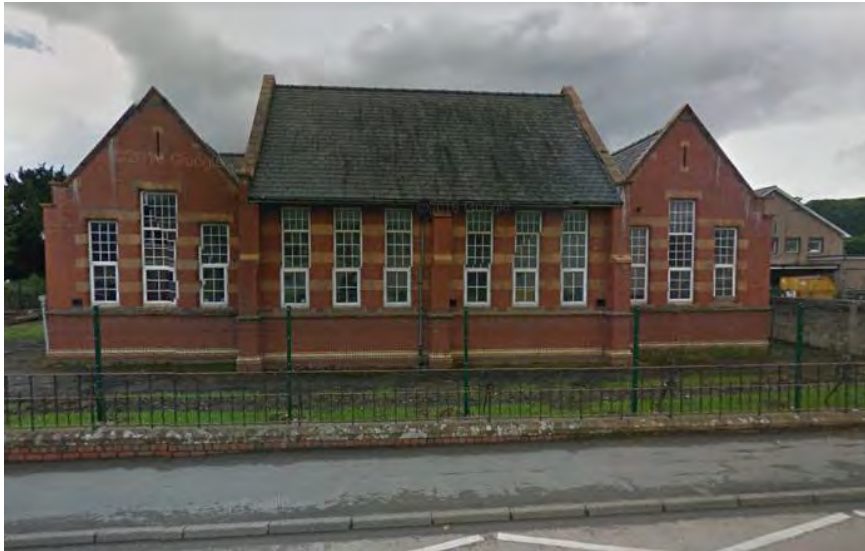
Figure 10 - Bala School (Ysgol y Berwyn), 1899, H Teather

As well as the cupolas/lanterns (many later shorn off), other elements were reminiscent of the London Board School style, as advocated by the prolific architect E.R. Robson (who designed at least 289 schools in London). These include the stepped windows, originally fitted with sashes, and tall chimney stacks to help draw the classroom fires.