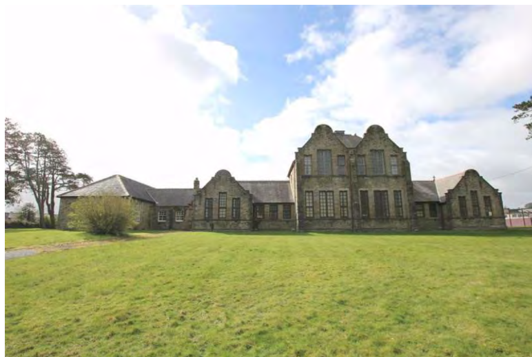
Figure 7 - Llangefni Schools (Penrallt Centre) 1900 by H. Teather

In terms of style, architects showed some invention, evidently where funds allowed. Many of the schools were relatively plain, built of local stone or brick (or both), rendered for economy in some examples (e.g. Tregaron, Aberaeron and Fishguard). The biggest architectural 'play' was embellishment of the gables, which were often shaped and usually provided with copings, for example Llangefni, Abergele and Ebbw Vale, among many others.