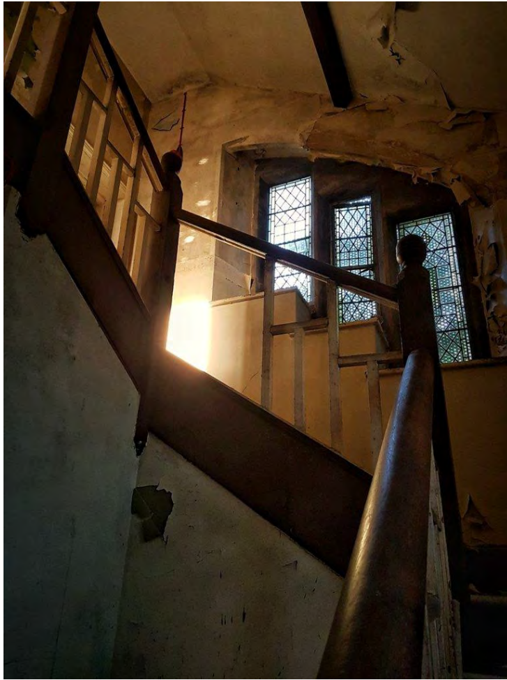
Figure 15 - 1896 staircase