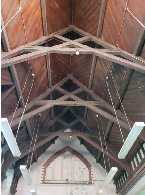
Figure 13 - open roof of original hall