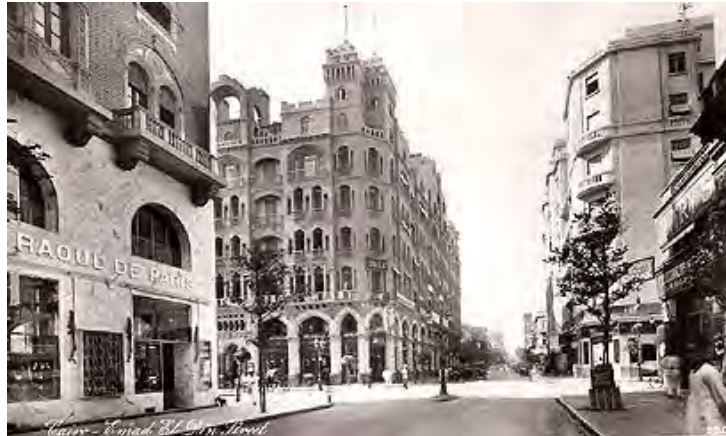
Figure 21 - The St David Building, Cairo (1910)

5.4 The architects - R.S. Griffiths. Rhys Samuel Griffiths, designer of the 1909 additions to the school is an easier figure to track down. Better known as R.S. Griffiths, he was born in Llannon, Carmarthenshire in 1859, son of Samuel Griffiths, master mason. By 1891, he was living at Llwynypia, described in the census as 'architect and land surveyor'. He was a local figure of some importance, serving as J.P. as well as a councillor for Rhondda District Council. Griffiths was a prolific and competent local architect, relied on for designing chapels, the municipal buildings at Pentre and the police station at Tonypany. He was a staunch Classicist (as his chapels show). As well as Cowbridge, Griffiths designed the intermediate schools at Whitland (1896) and extended the boys' intermediate school at Gelligaer, in 1903.