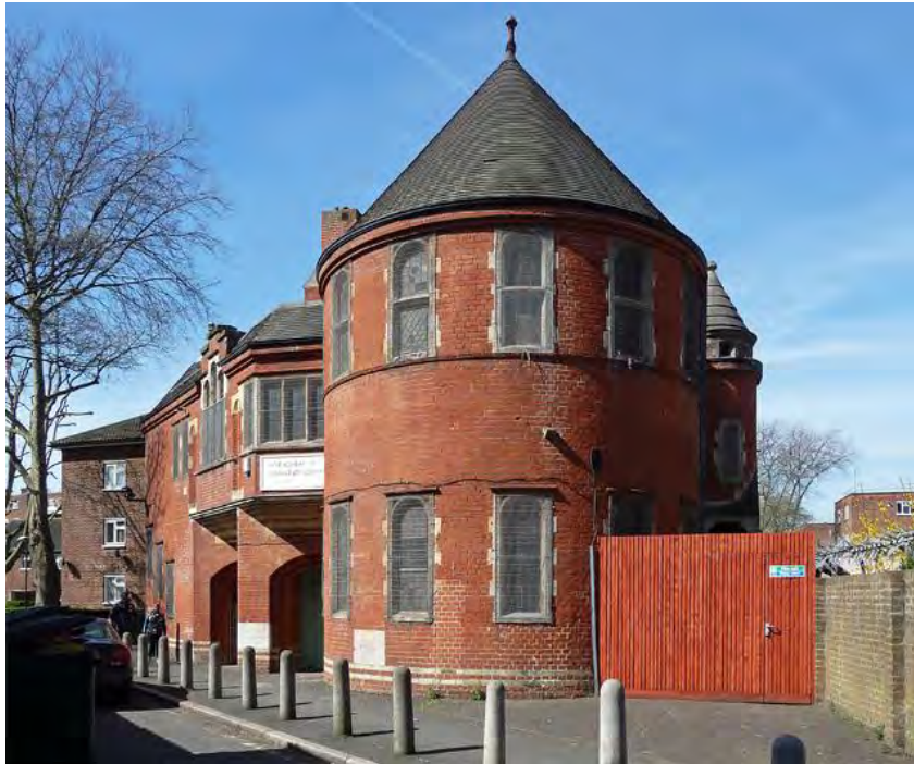
Figure 18 - the Wheatsheaf Hall, Vauxhall (1896)