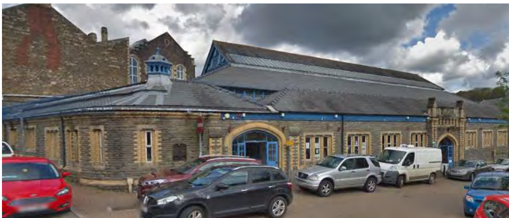
Figure 19 - Pontypool Market 1893-4