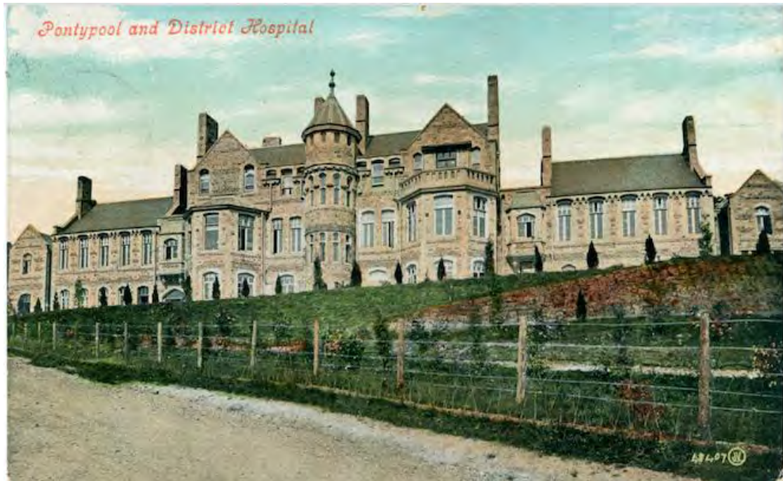
Figure 20 - Pontypool Hospital (1903)