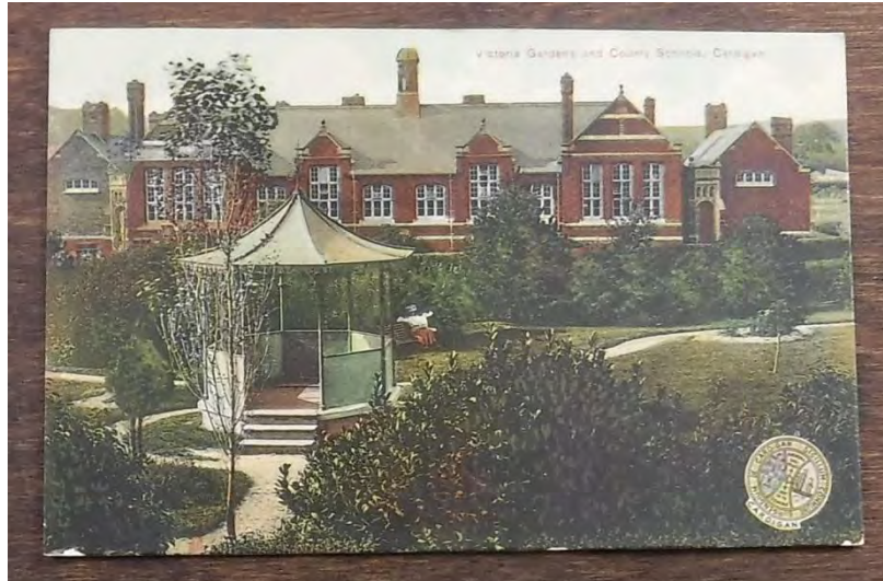
Figure 6 - Cardigan Intermediate Schools - 1895-8 by George Morgan

In terms of style, architects showed some invention, evidently where funds allowed. Many of the schools were relatively plain, built of local stone or brick (or both), rendered for economy in some examples (e.g. Tregaron, Aberaeron and Fishguard). The biggest architectural 'play' was embellishment of the gables, which were often shaped and usually provided with copings, for example Llangefni, Abergele and Ebbw Vale, among many others.